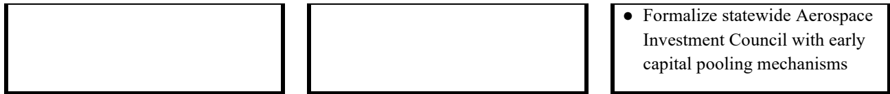
Figure 2: Recommended investment pathways over the next 20 months, showing how different funding levels translate into action, outcomes, and long-term positioning for Maryland’s aerospace strategy.